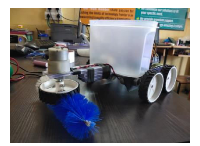
Figure No. 11: Solar cleaning machine

4. All this cleaning actions will consume a time of 30 sec for mopping action for both movements of cleaning system