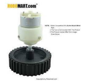
Figure No. 3: Wheels

Wheels Specifications: Wheel Diameter: 70mm. Wheel Width: 40mm. Shaft Diameter: 6mm