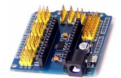
Figure No. 7: Arduino Nano Expansion Shield